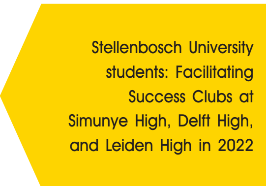
Stellenbosch University students: Facilitating Success Clubs at Simunye High, Delft High, and Leiden High in 2022