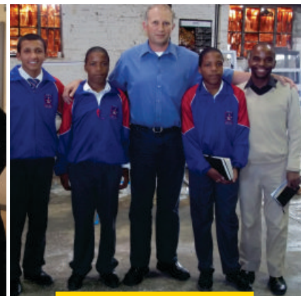
Supporters and helpers:

1) We celebrate the efforts of teachers and non-academic staff at all Delft Schools acting as coordinators for the BBCM-projects; 2) we applaud the committed work of our many voluntary workers, namely the facilitators of our clubs called Prayer Warriors, Power Moms, Angel Moms, Delft Daisies, Success Clubs, Reading Clubs, Drama Club, Music and Choir Clubs, as well as the Rugby Club; 3) we are so proud of the committed efforts of all Delft youth who partake as active members of our clubs; and 4) we honour the prayer- and financial support as well as so many other blessings, e.g., food and clothes from people acting as Father God's Kingdom Givers.