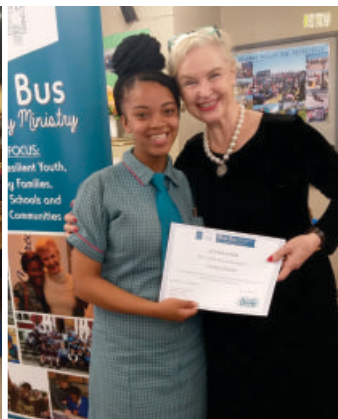
Learners partaking in BBCM clubs